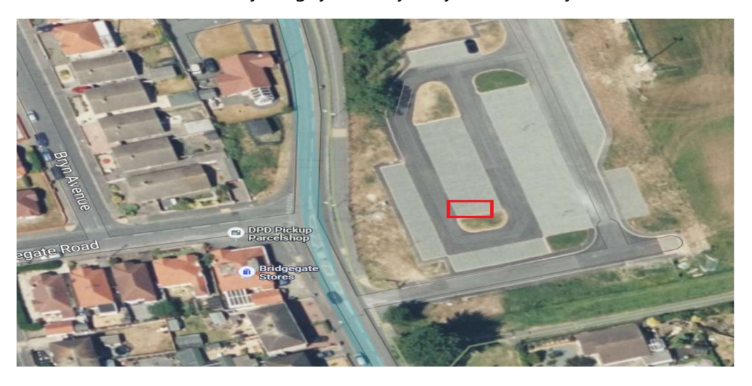
CREW VAN LOCATION: St Mary's Church, 119 Wellington Road, Rhyl, LL18 1LE