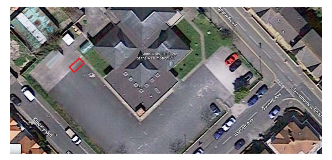
Please ensure the vehicle is parked in the area marked by the red rectangle.